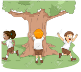
Hide and seek (cache-cache)